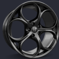
19" Dark Finish 5 Pocket Alloy Wheel STANDARD