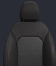
Black Cloth Seat Upholstery STANDARD

Tecnico Pack - Traffic Jam Assist and Highway Assist, Intelligent Speed Control Leather Seat Pack - Sporty Leather Seats, Power Bolsters, Front Heated Seats, Heated Steering Wheel, 6 Way Power Front Seats (driver with memory) + 4 Way Lumbar Adjuster