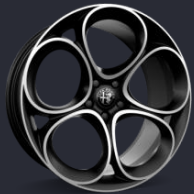
19" Dark Finish 5 Petal Alloy Wheel OPTIONAL