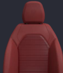
Red Leather Sports Seats OPTIONAL