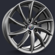
18" Turbine Alloy Wheel STANDARD