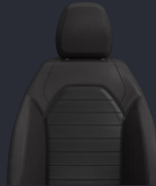
Black Leather Sports Seats STANDARD

Sporty Leather Seats in Black or Red Leather