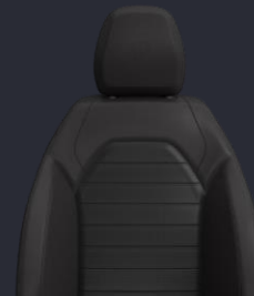
Black Leather Sports Seats OPTIONAL

Sporty Leather Seats in Black or Red Leather