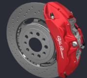
Red Painted Brake Callipers OPTIONAL