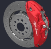
Red Painted Brake Callipers STANDARD