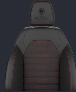
Black Sports Leather Sports Seats with Red Stitching STANDARD