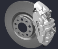
Grey Painted Brake Callipers STANDARD

Sporty Leather Seats in Black or Red Leather