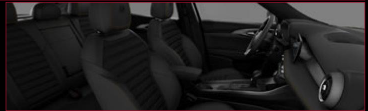
047 - Carbon Cloth and Leatherette Seats with Electro-welded Alfa Romeo Logo and Biscotto Stitching (Standard on Ti and Speciale)