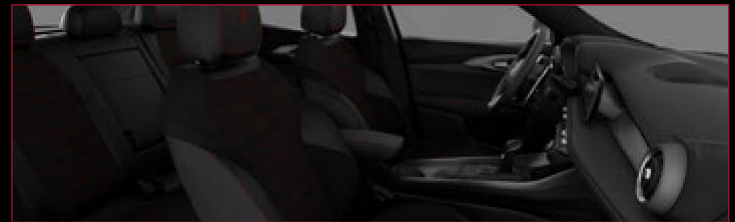
783 - Perforated Black Alcantara and Leatherette Seats with Embroidered Alfa Romeo Logo and Red Stitching and Shadowing (Standard on Veloce)