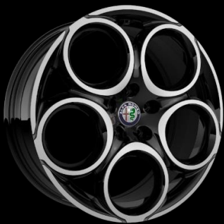
WBR 18" Alloy wheel dark finish, diamond cut