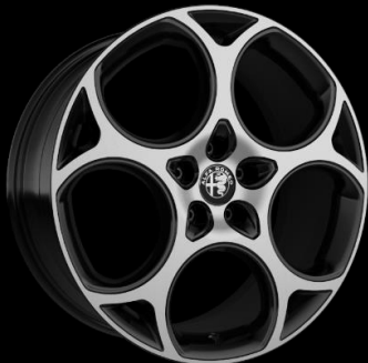
1MM 19" Alloy wheel dark finish, diamond cut