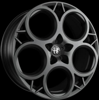
1M4 20" Alloy wheel grey finish