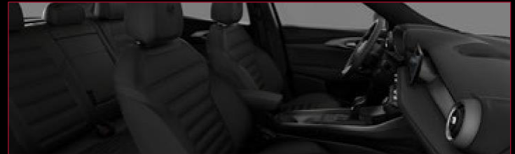
428 - Perforated Black Leather Accented Seats with Embroidered Alfa Romeo Logo and Dark Grey Double Stitching (Part of Premium Pack, Optional on all versions )