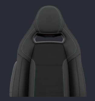
Alcantara and Leather Sparco Sports Seats with Green and Ice Stitching OPTIONAL