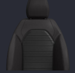
Quadrifoglio Leather Sports Seats STANDARD