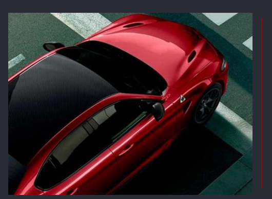
Exposed Carbon Fibre Roof OPTIONAL